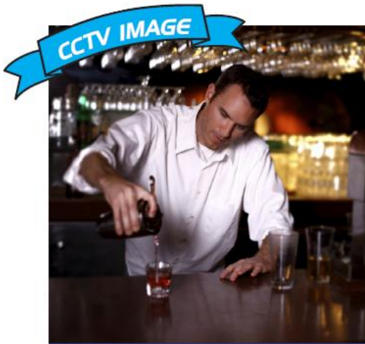
The picture below shows, without a doubt, that not all items passed over the counter were entered into the cash register.

THE VSI-Pro-MAX SAVES YOU MONEY BY KEEPING IT IN THE TILL!